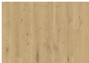
Kappadokien CLA 200