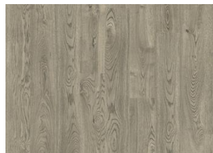
Jasper CLA 200