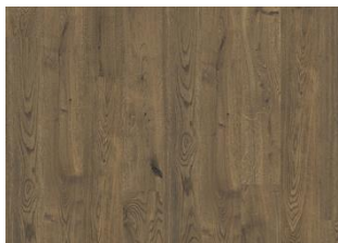
Yellowstone CLA 200