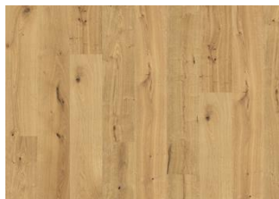
Grand Canyon CLA 200