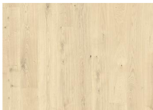
Bwindi CLA 200