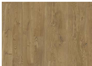
Serengeti CLA 200