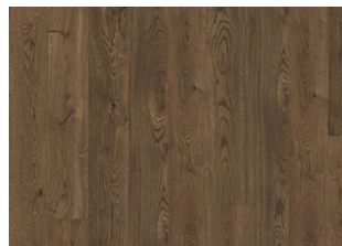
Smoky CLA 200