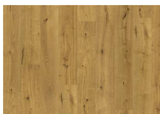
Yosemite CLA 200