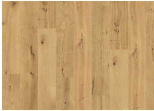
Grand Canyon CLA 200