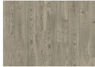
Jasper CLA 200