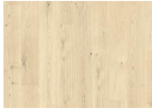
Bwindi CLA 200