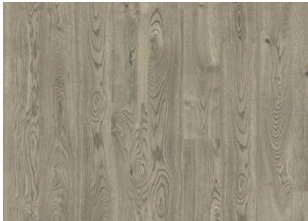
Jasper CLA 200