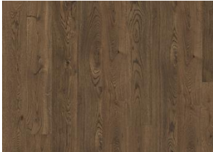
Smoky CLA 200