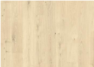
Bwindi CLA 200