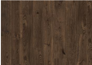
Rocky CLA 200