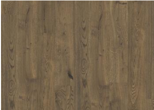
Yellowstone CLA 200