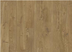
Serengeti CLA 200