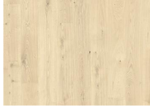
Bwindi CLA 200