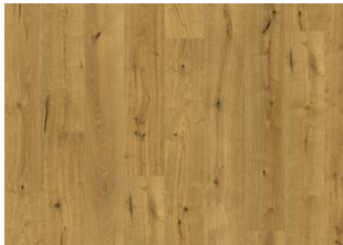
Yosemite CLA 200