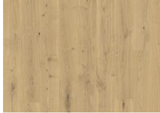
Kappadokien CLA 200