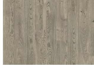
Jasper CLA 200