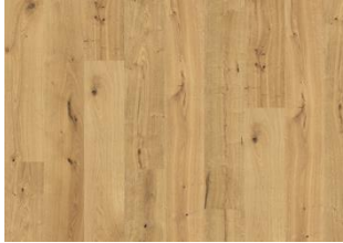
Grand Canyon CLA 200