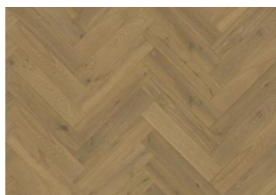
Herringbone Oak CD Grey