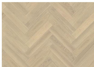
Herringbone Oak AB White