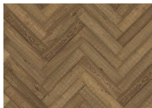
Herringbone Oak CD Smoked