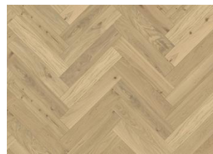
Herringbone Oak CC Dim White