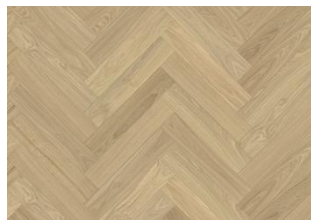
Herringbone Oak AB Dim White