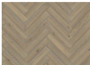
Herringbone Oak CC Vintage White