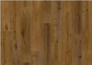
Marrone CLW 228