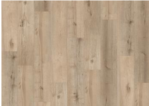
Sabiano CLW 228