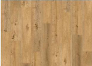
Tobiano CLW 228