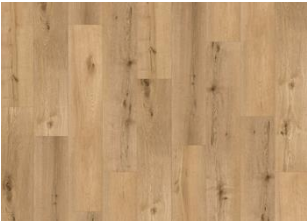
Roan CLW 228

All samples, images and product description, plus photo and brochure specifications are there for the sole purpose of giving an approximate idea of the items described in them. They shall not form part of the contract or have any contractual force and should be viewed for illustrative purposes only. We cannot guarantee that your computer's display or the quality of the print will accurately reflect the colour of the products. Your product may vary slightly from the images within this literature.