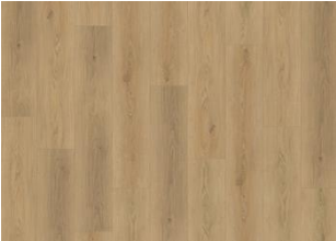
Palomino CLW 228