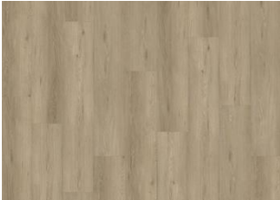
Perlino CLW 228