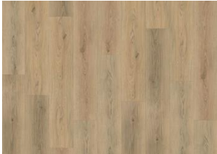
Amber CLW 228