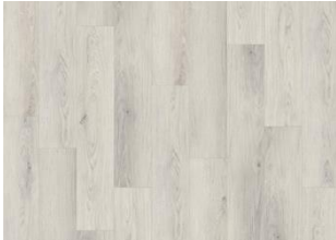
Cremello CLW 228

All samples, images and product description, plus photo and brochure specifications are there for the sole purpose of giving an approximate idea of the items described in them. They shall not form part of the contract or have any contractual force and should be viewed for illustrative purposes only. We cannot guarantee that your computer's display or the quality of the print will accurately reflect the colour of the products. Your product may vary slightly from the images within this literature.