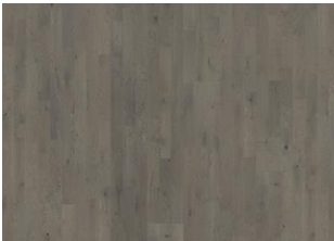
OAK PEARL GREY STRIP