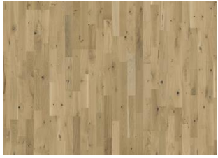
OAK URBAN BROWN STRIP