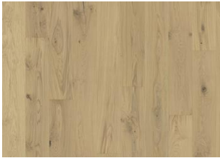
Oak Urban Brown Plank