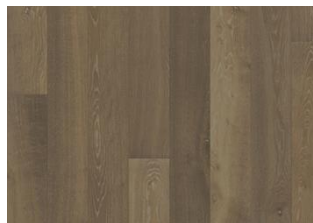
Oak Nouveau Greige