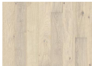
Oak Nouveau Blonde