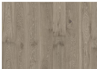
Oak Nouveau Gray