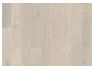
Oak Nouveau Snow