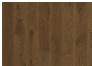
Oak Nouveau Rich