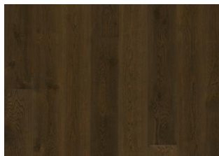
Oak Nouveau Tawny