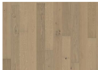
Oak Nouveau White