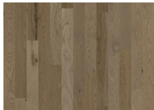
HICKORY FAIR LANE