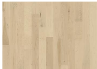
HARD MAPLE OHEKA