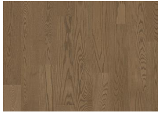
RED OAK VERNON