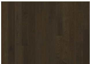
HICKORY BAYOU BEND