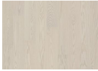
RED OAK SWAN