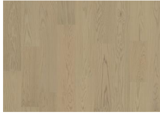
RED OAK HIGHLANDS