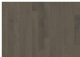
HARD MAPLE LYNDHURST