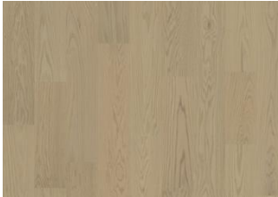
RED OAK HIGHLANDS