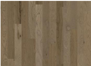
HICKORY FAIR LANE