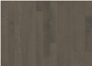
HARD MAPLE LYNDHURST