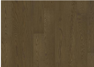
RED OAK BINGHAM