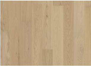
RED OAK VIZCAYA