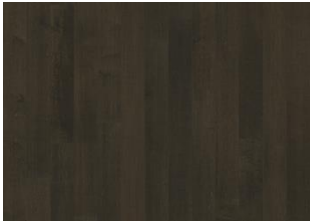
HARD MAPLE WESTBURY