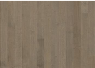
HARD MAPLE CRANE