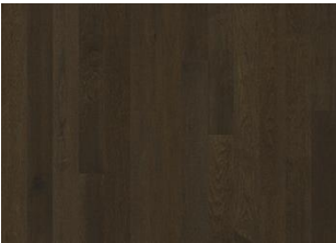
HICKORY BAYOU BEND