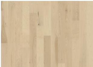
HARD MAPLE OHEKA