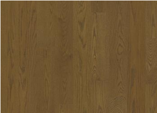
RED OAK HILDENE