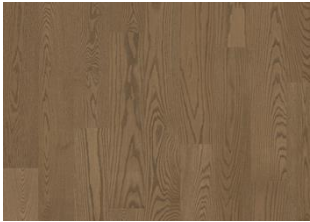
RED OAK VERNON