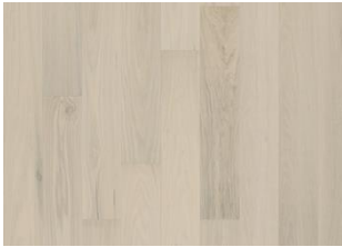
RED OAK NEMOUR