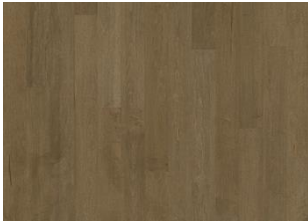
HARD MAPLE BISHOP