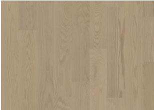
RED OAK BREAKERS