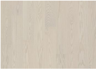
RED OAK SWAN