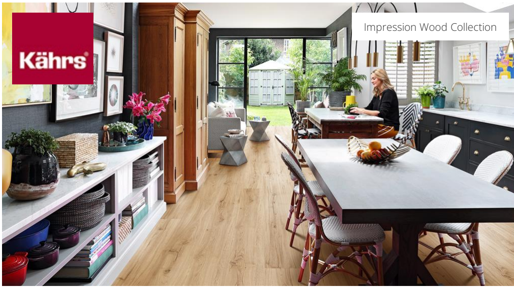
Impression Wood Collection