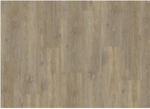
TAIGA - DRY BACK