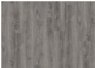
PLITVICE DRY BACK