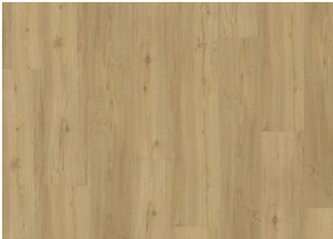
OULANKA - DRY BACK