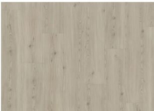
TRIGLAV - DRY BACK