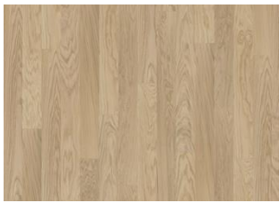
WHOLE GRAIN NARROW