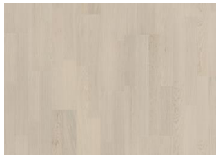
COCONUT CREAM 2-STRIP