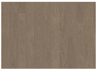
EARL GREY WIDE