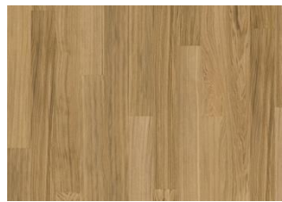
PURE OAK WIDE