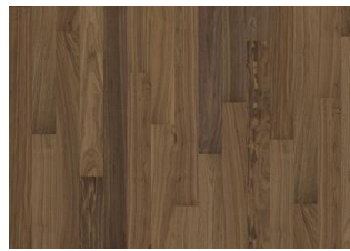
PURE WALNUT NARROW