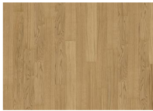
PURE OAK NARROW