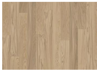
WHOLE GRAIN WIDE