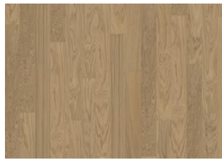
LIGHT SUEDE NARROW