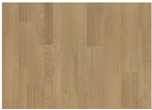
LIGHT SUEDE 2-STRIP