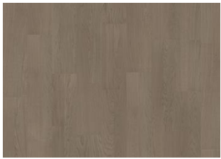
EARL GREY 2-STRIP