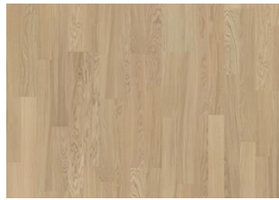
WHOLE GRAIN 2-STRIP