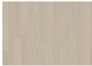
COCONUT CREAM NARROW