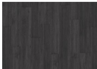
Schwarzwald - Click 5 mm