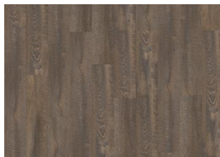
Kannur - Click 5 mm