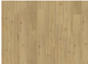
Oulanka - Click 5 mm