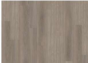
Whinfell - Click 5 mm

All samples, images and product description, plus photo and brochure specifications are there for the sole purpose of giving an approximate idea of the items described in them. They shall not form part of the contract or have any contractual force and should be viewed for illustrative purposes only. We cannot guarantee that your computer's display or the quality of the print will accurately reflect the colour of the products. Your product may vary slightly from the images within this literature.