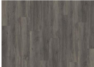
Niagara - Click 5 mm