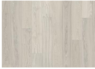
OAK CELERY PLANK