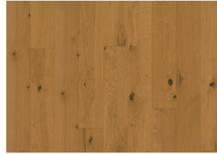
OAK PEPPER PLANK