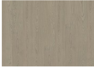
OAK CUMIN PLANK