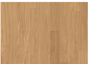
OAK NUTMEG PLANK