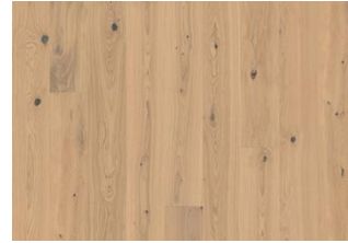
OAK TURMERIC PLANK