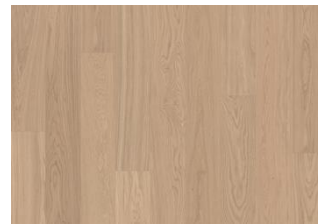
OAK GINGER PLANK