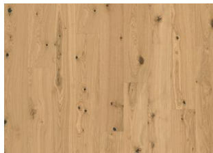
OAK FENNEL PLANK