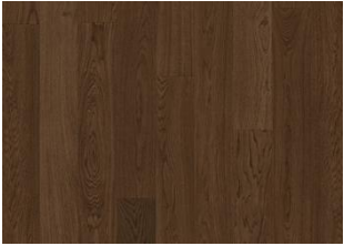
OAK SAFFRON PLANK