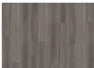
Wentwood - Click 5 mm