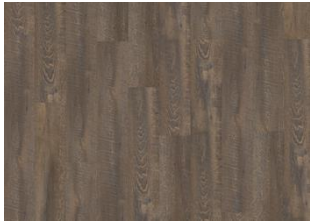
Kannur - Click 5 mm