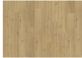
Oulanka - Click 5 mm