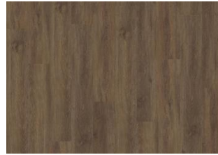
Belluno - Click 5 mm