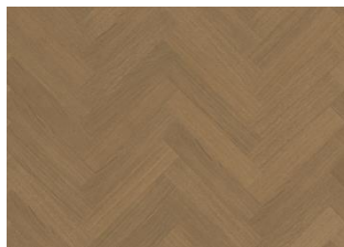
OAK SAGE HERRINGBONE