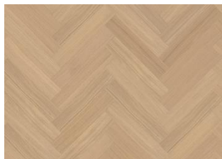
OAK GINSENG HERRINGBONE