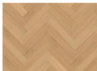
OAK CHAMOMILLE HERRINGBONE