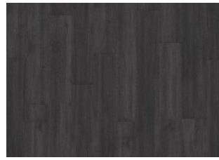
Schwarzwald - Click 5 mm