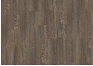
Kannur - Click 5 mm