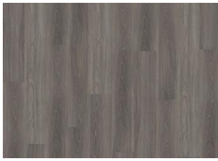
Wentwood - Click 5 mm