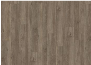
Sarek - Click 5 mm