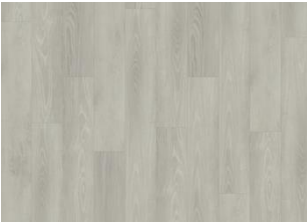
Yukon - Click 5 mm