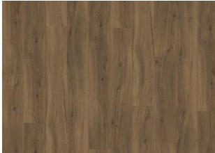
Redwood - Click 5 mm