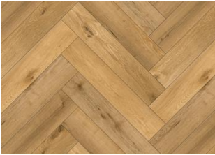
Radiance Herringbone CHW 150