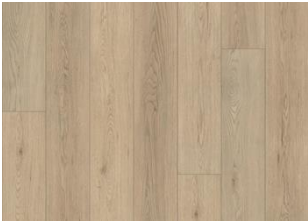
Sunlight CLW 228 Plank