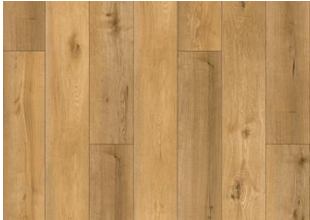
Radiance CLW 228 Plank