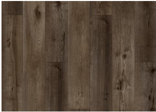
Celestial CLW 228 Plank