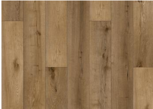
Solandra CLW 228 Plank