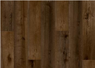
Elysian CLW 228 Plank