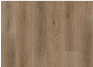
Sylvan CLW 228 Plank