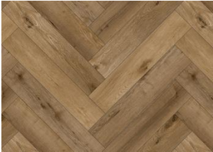
Solandra Herringbone CHW 150