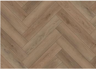
Sylvan Herringbone CHW 150