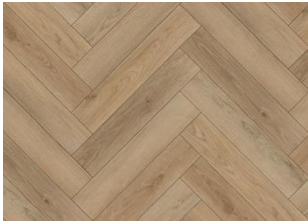
Mystic Herringbone CHW 150