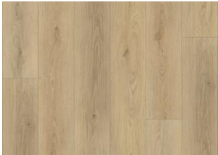
Tranquility CLW228 Plank