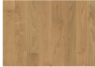
OAK DAHLIA MATT