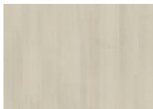
Aspen - Click 6 mm