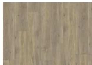
Taiga - Click 6 mm