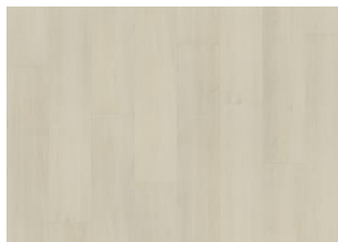
Aspen - Click 6 mm