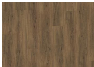
Redwood - Click 6 mm