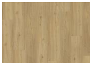
Oulanka - Click 6 mm