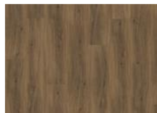
Redwood - Click 6 mm