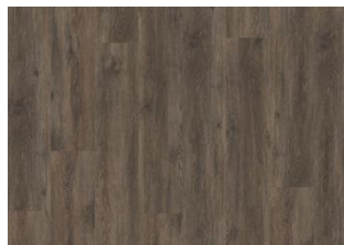
SAXON CLICK 6 MM