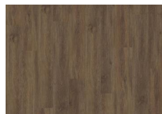
BELLUNO DRY BACK