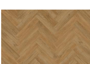
SAPO DRY BACK HERRINGBONE