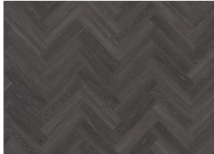
CALDER DRY BACK HERRINGBONE