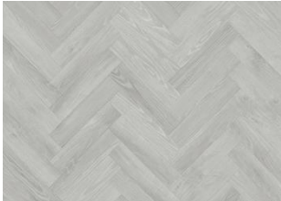
YUKON DRY BACK HERRINGBONE