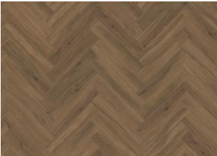
REDWOOD DRY BACK HERRINGBONE