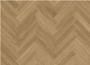
HANMER DRY BACK HERRINGBONE