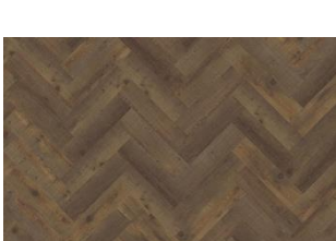
KOMI DRY BACK HERRINGBONE