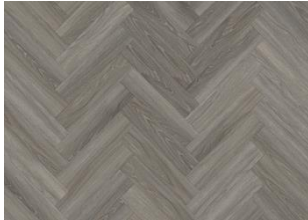
WENTWOOD DRY BACK HERRINGBONE