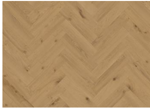
COCONINO DRY BACK HERRINGBONE