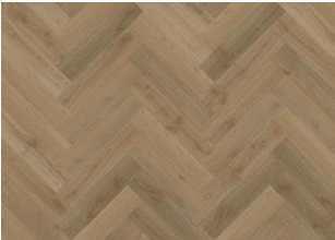
BLAIKEN DRY BACK HERRINGBONE