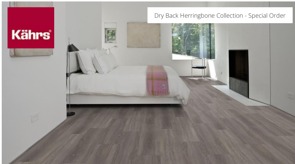
Dry Back Herringbone Collection - Special Order