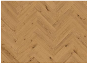
THURINGIAN DRY BACK HERRINGBONE