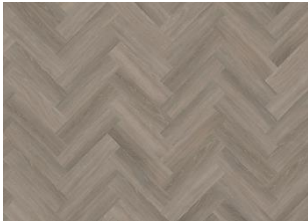
WHINFELL DRY BACK HERRINGBONE