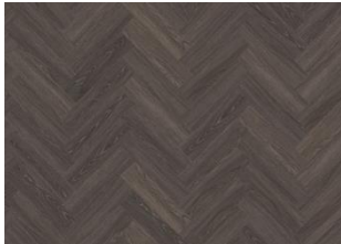
TONGASS DRY BACK HERRINGBONE