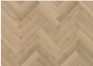
KILSBERGEN DRY BACK HERRINGBONE