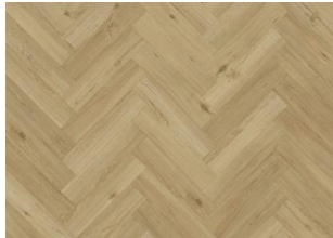
OULANKA DRY BACK HERRINGBONE