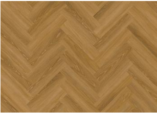
FONTIN DRY BACK HERRINGBONE