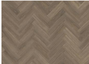
TIVEDEN DRY BACK HERRINGBONE