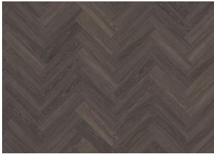
Tongass - Dry Back Herringbone