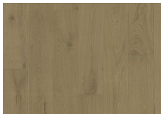
OAK WEATHERED WIDE MATT