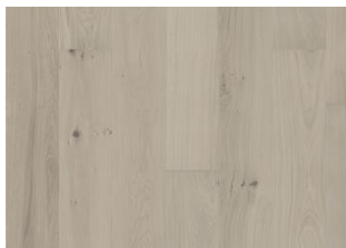
OAK MUSE WIDE MATT