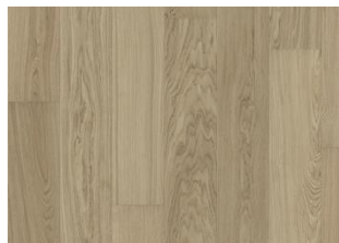
OAK TAPA WIDE MATT