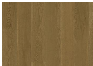
OAK LATTE WIDE MATT