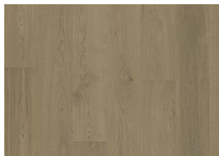
OAK REITER WIDE MATT