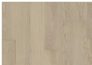
OAK FAWN WIDE MATT