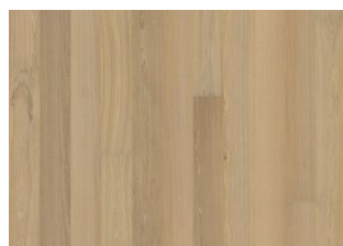
OAK PARIS ULTRA MATT NARROW