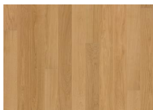
OAK DUBLIN ULTRA MATT NARROW