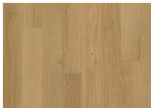
OAK DUBLIN ULTRA MATT