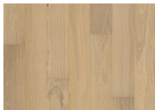
OAK PARIS OILED