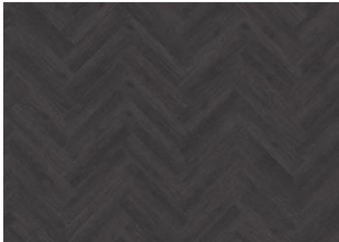
Schwarzwald - Dry Back Herringbone

All samples, images and product description, plus photo and brochure specifications are there for the sole purpose of giving an approximate idea of the items described in them. They shall not form part of the contract or have any contractual force and should be viewed for illustrative purposes only. We cannot guarantee that your computer's display or the quality of the print will accurately reflect the colour of the products. Your product may vary slightly from the images within this literature.