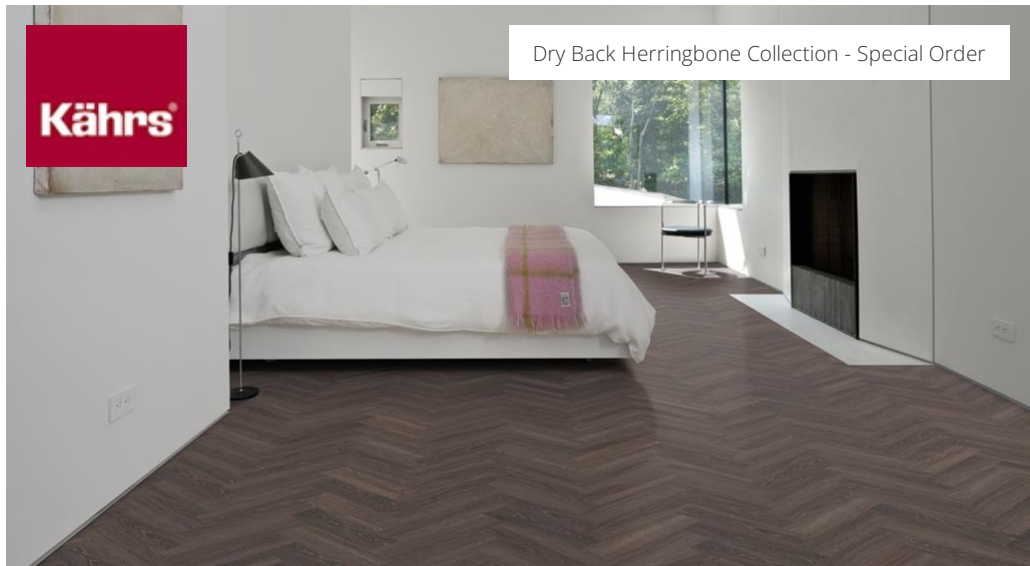
Dry Back Herringbone Collection - Special Order