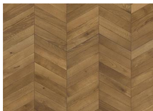
Oak Chevron Light brown