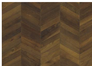
Oak Chevron Dark brown