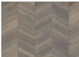
Oak Chevron Grey