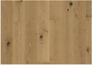
OAK ASTER OILED