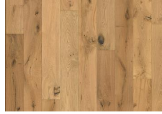
OAK LYNX OILED