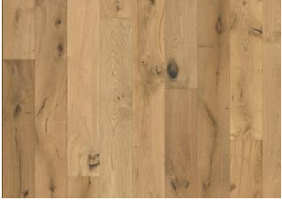
OAK LYNX ULTRA MATT