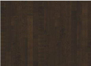
OAK CURIO MATTE