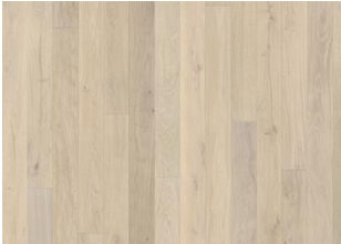
OAK CADENCE MATTE