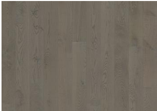
OAK CARBON MATTE