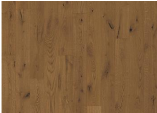
OAK TUFT MATTE