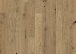
OAK ETCH MATTE