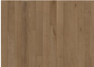
OAK HENNA MATTE