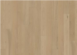
OAK FAWN MATTE