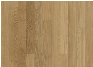
OAK TAPA MATTE