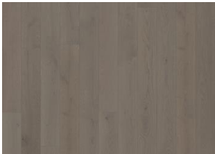
OAK MOREL MATTE