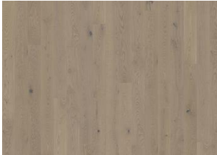
OAK PRATICA MATTE