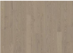
OAK REITER MATTE