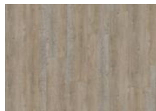
Cormorant - Loose Lay