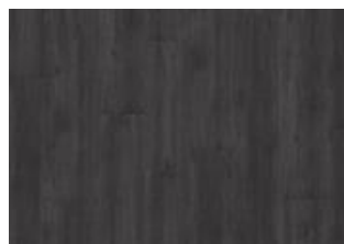
Schwarzwald - Loose Lay