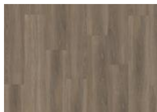
Tiveden - Loose Lay