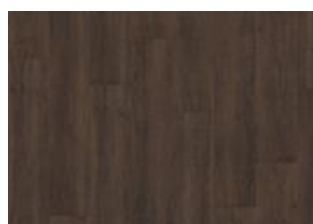
Burnham - Loose Lay