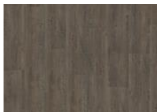
Gorbea - Loose Lay