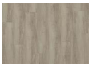
Snowdonia - Loose Lay