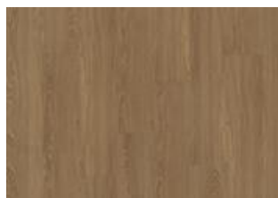
Sherwood - Loose Lay