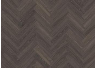
Tongass - Dry Back Herringbone