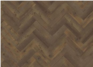
Komi - Dry Back Herringbone