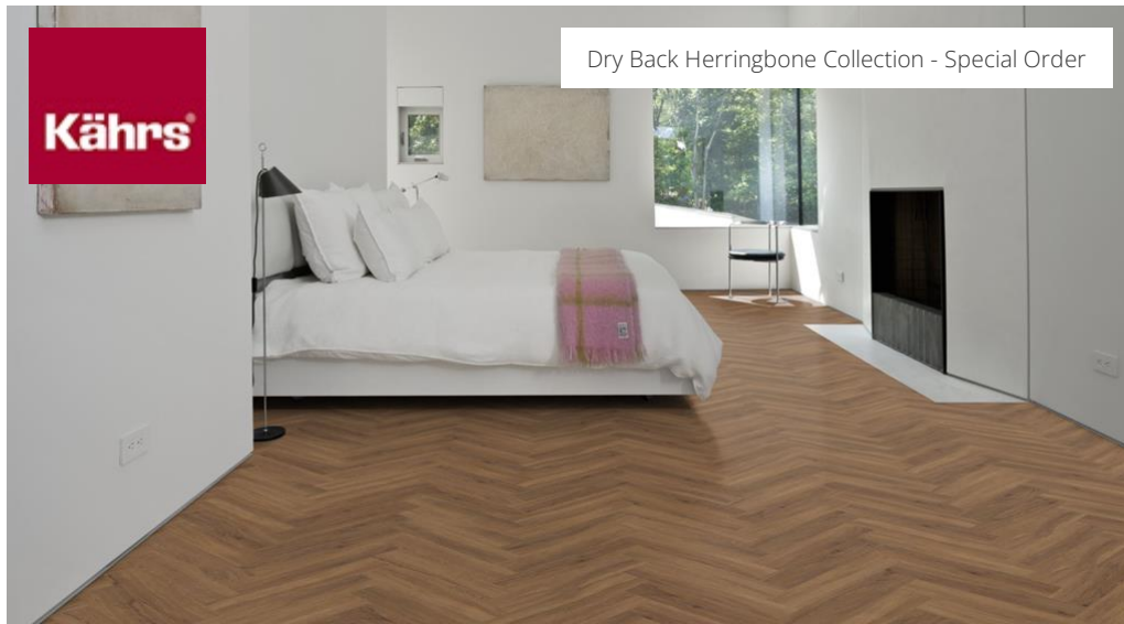
Dry Back Herringbone Collection - Special Order