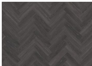
CALDER - DRY BACK HERRINGBONE