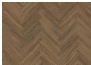
REDWOOD - DRY BACK HERRINGBONE