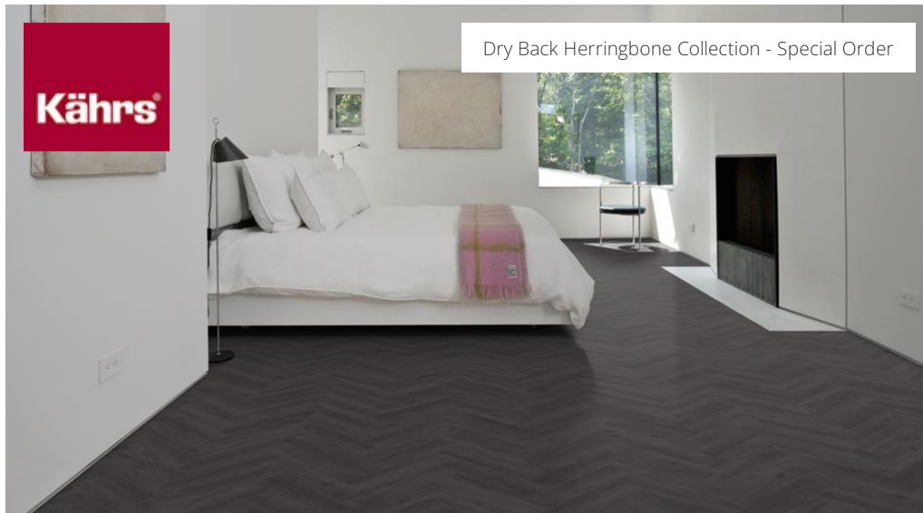
Dry Back Herringbone Collection - Special Order