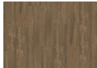
DURMITOR DRY BACK