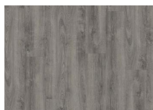
PLITVICE DRY BACK