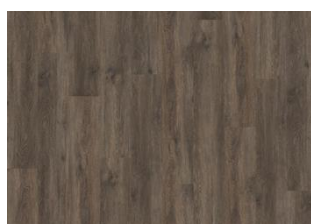
SAXON DRY BACK