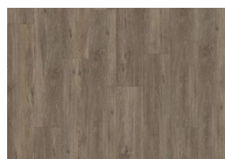
SAREK DRY BACK