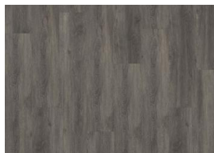
NIAGARA DRY BACK