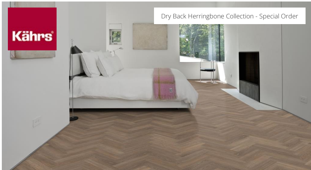
Dry Back Herringbone Collection - Special Order