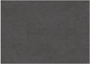
Schwarzhorn - Loose Lay