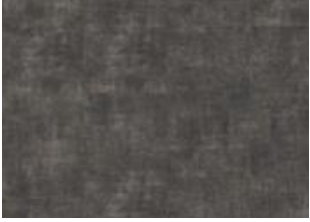
Steele - Loose Lay