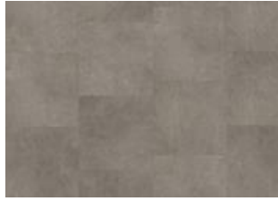
Pamir - Loose Lay