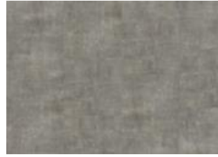
Matterhorn - Loose Lay