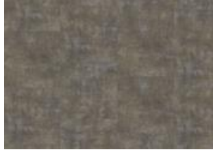
Denali - Loose Lay